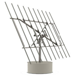
DEGERtracker 5000NT (1)