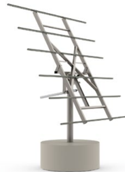
DEGERtracker 3000NT (1)