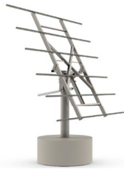
DEGERtracker 3000HD (1)