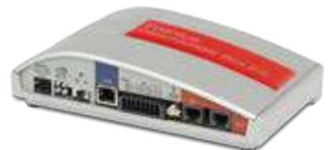
/ Fronius Datamanager Box 2.0