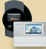
Solar-Log™ and Meteocontrol WEB'log Accessories