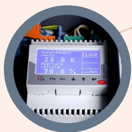
ELECTRONIC EXPANSION VALVE