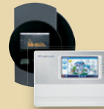
Solar-Log™ and Meteocontrol WEB'log Accessories